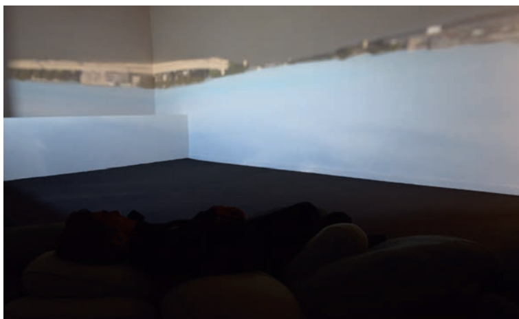
16 May - 31 October, 2013 / exhibition Nuage , Réattu Museum, Arles

Book révolutions, Céleste Boursier-Mougenot French Pavilion at the 56 th International Exhibition of Visual Arts La Biennale di Venezia, 2015