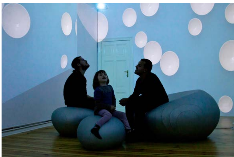
7 September - 2 November, 2013 / exhibition presences , Mazzoli Gallery, Berlin