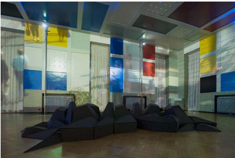
6 September - 22 November, 2014 / exhibition persistances , Museum Aubette 1928, Strasbourg