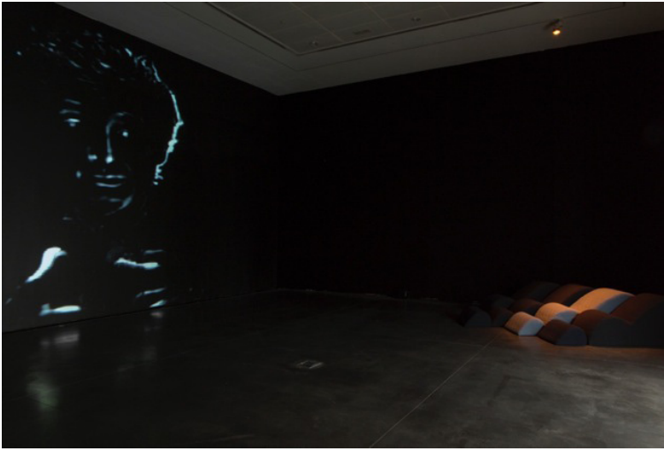
31 January - 4 May, 2014 / exhibition perturbations , les Abattoirs, Toulouse